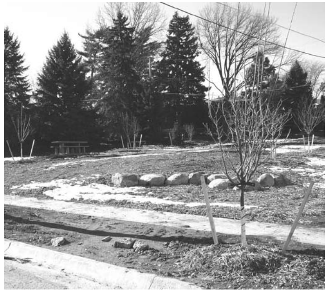
50th and N landscaping site

WNA wishes to thank Tabitha for being a great neighbor and providing meeting space for us each month. We appreciate it.