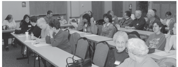
Neighbors anticipate start of Annual Meeting