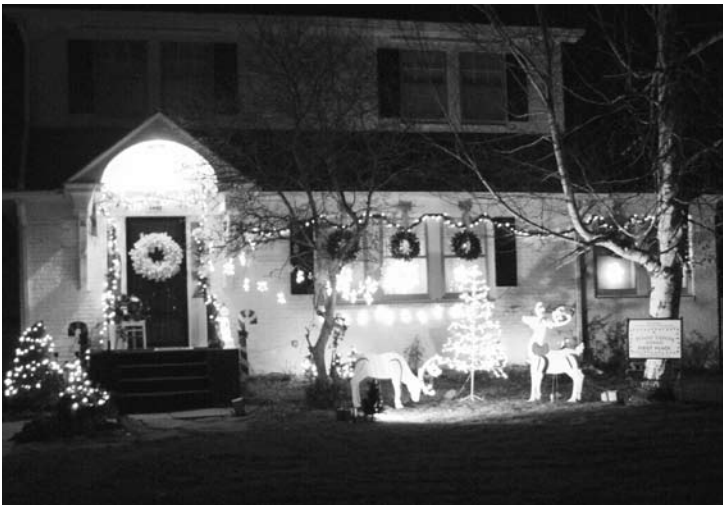
First Place home at 3400 Woods Ave.